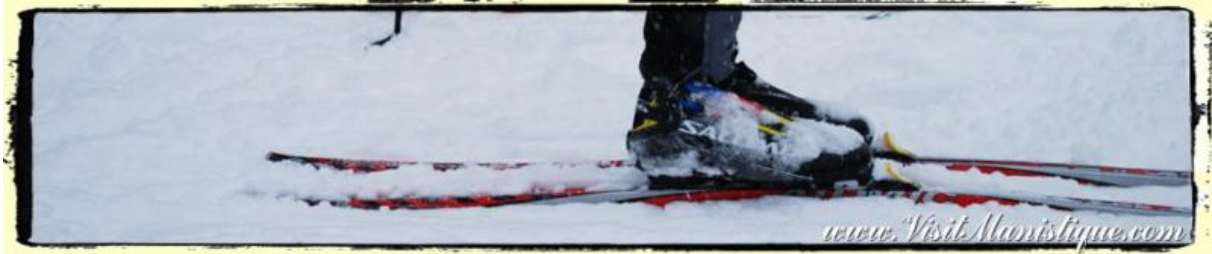
Click image for XCountry Ski Trails