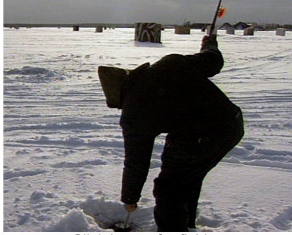
Click image for fishing