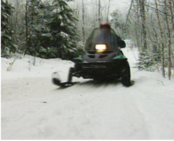
Click image for trails