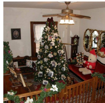
Christmas at Seul Choix Point Lighthouse

Stay in Manistique - your gateway to Schoolcraft County, only 35 miles from Christmas, and miles of beautiful shoreline along Lake Michigan.