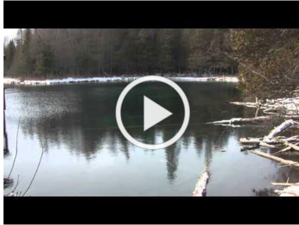
Great Getaways: Kitch-iti-kipi (The Big Spring) - Palms Book State Park, MI

With every type of lake you can imagine from Lake Michigan to the 4th largest inland lake in the U.P. to the wonderfully remote wilderness lakes provided by the Hiawatha National forest, Manistique is an ice anglers best dream.