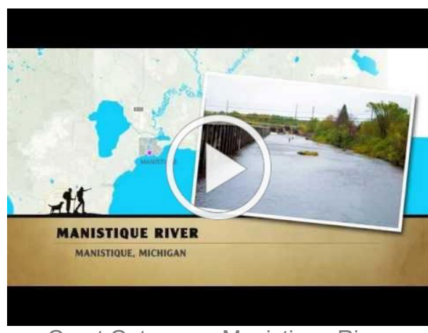
Great Getaways: Manistique River [Manistique, MI Fishing]