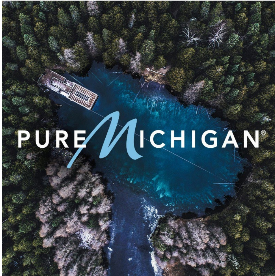
Fayette Historic State Park - a unique snowshoeing experience